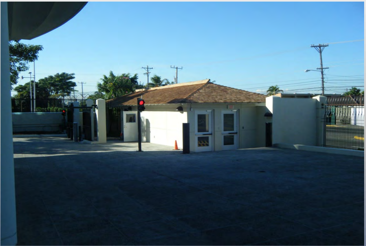
International Guard House and Sally Port, Caribbean