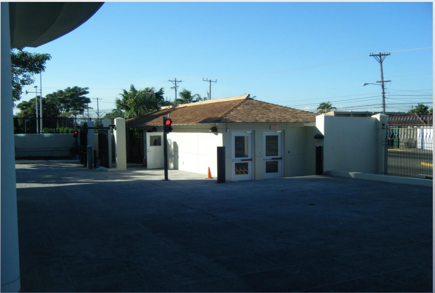
International Guard House and Sally Port, Caribbean