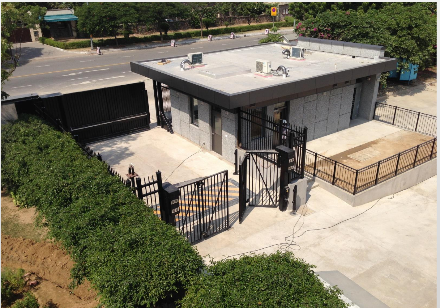
International Guard House and Sally Port, South Asia